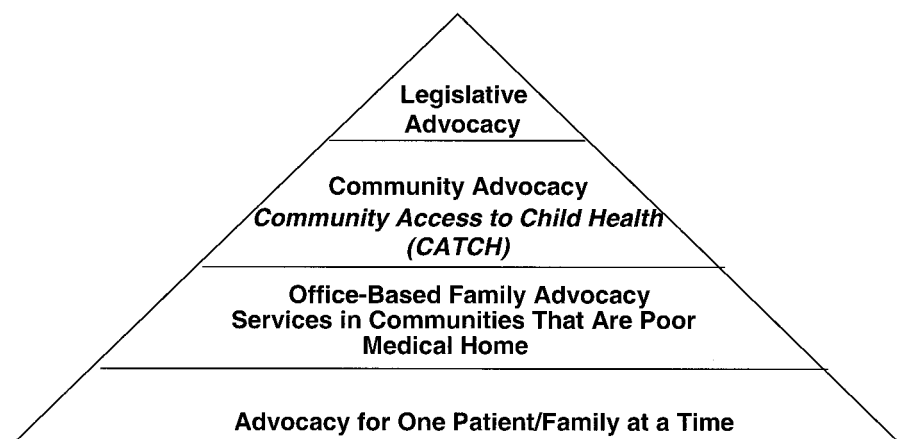
Fig 2. The advocacy pyramid.

Pediatricians also can support families that are poor in their practices by connecting them with the services for which they qualify or need in the community. Pediatricians can use materials supplied by community programs to screen their patients and families for social and economic risk factors, adding this screening approach to their regular child development and family social screening. In this way, the pediatrician can assess whether the child or family qualifies or could benefit from the social and income support programs available to poor families. Pediatricians should be knowledgeable about Head Start; Special Supplemental Nutrition Program for Women, Infants, and Children; food stamps; housing support services; and other income and social support programs in their communities and know how to refer families to them. Links to local health departments also can provide access to resources that are